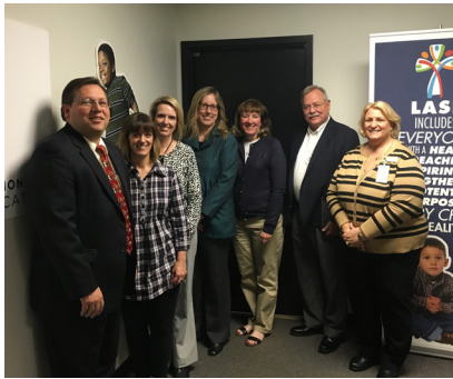
Thank you NLSA Accreditation Team!

The 2016–17 school year was a change for LASE. The footprint of our ministry is extensive and we are both proud of our rich 60-year legacy and excited about continuing