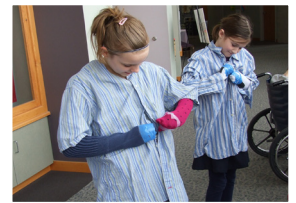
St. Mark’s students during disability simulation activities.