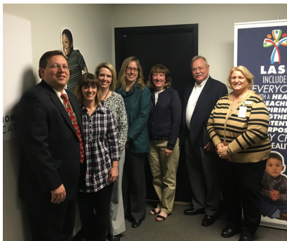
Thank you NLSA Accreditation Team!

The 2016–17 school year was a change for LASE. The footprint of our ministry is extensive and we are both proud of our rich 60-year legacy and excited about continuing