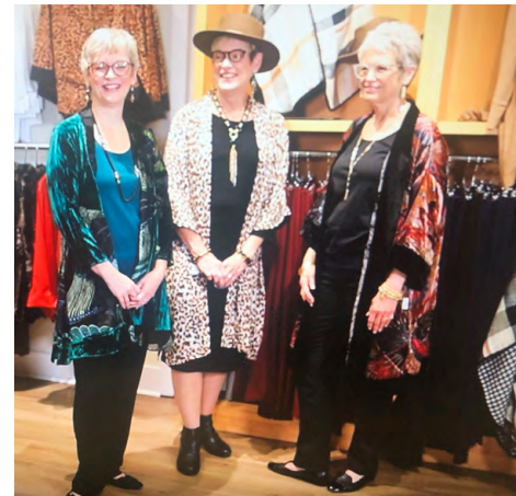
LASE Models - Chico's West County

More than 200 guests joined together virtually to celebrate 25 years of Herald the Holidays and it's many families and friends. They enjoyed the LASE program, bid on silent auction items, purchased boutique items and shopped fashions from Chico's - West County. Thanks to you, over $53,000 was raised to directly impact the lives of LASE students. Let's rekindle the treasured tradition of kicking off our holiday season by joining together for Herald the Holidays on Saturday, November 5, 2022 at the Doubletree Hilton - Westport!