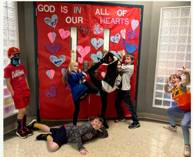
Project and celebratory students from Immanuel Lutheran School in St. Charles