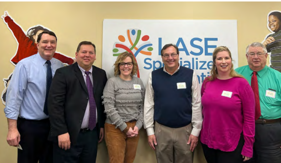
Thank you, NLSA Visiting Team!